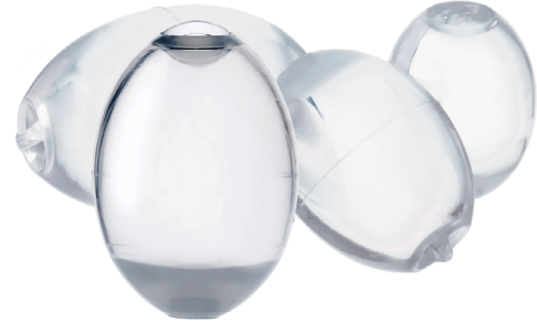
Four sizes available. See back for details.

Testicular prostheses are safe to implant at the time of orchiectomy for testicular cancer. Torosa can be implanted with few complications and with a low or absent risk of rheumatological disease. 9